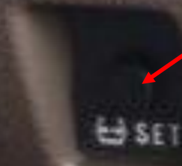
TYRE PRESSURE SET SWITCH