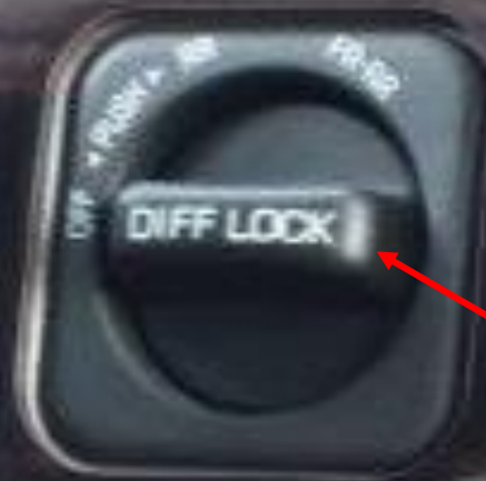
DIFFERENTIAL LOCK KNOB